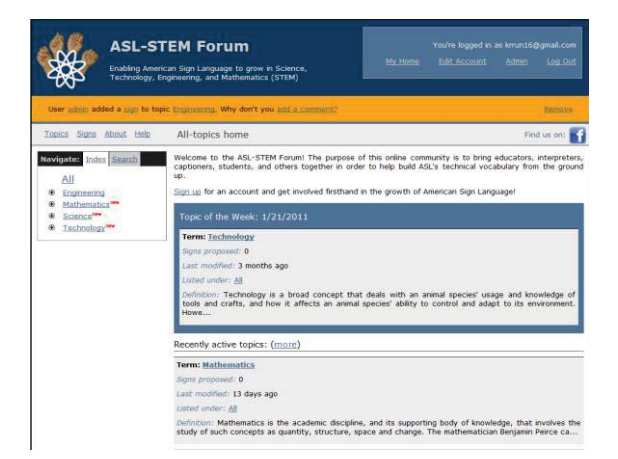
Figure 2. ASL-STEM Forum with a notification: "User admin added a sign to topic Engineering. Why don't you add a comment?"

With the addition of the personal smart notifications, we anticipate participants will be more involved. Contributions could come in the form of completing signs for a particular user they know and are familiar with, or starting a discussion via comments about a particular sign. Members will also have an easier time contributing to the ASL-STEM Forum, since they will get suggestions to contribute to areas they find more interesting. If members are more willing to contribute to the forum, then Deaf and Hard of Hearing individuals will have more resources when looking for signs in STEM.