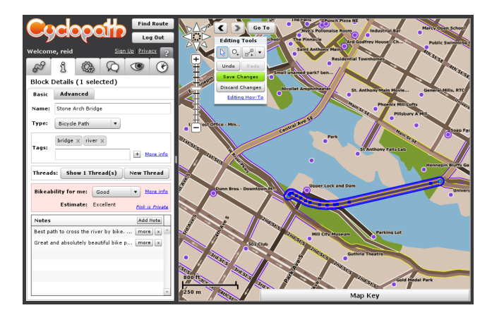
Figure 4: The Cyclopath user interface. In addition to finding bicycle routes, the system also lets users edit the transportation network and other map objects. The system has over 2,500 registered users and been accessed by 32,000 unique IP addresses. Of the 13,384 revisions to the Cyclopath map, 7,980 (60%) affect the graph and 8,718 (65%) affect more than one object.